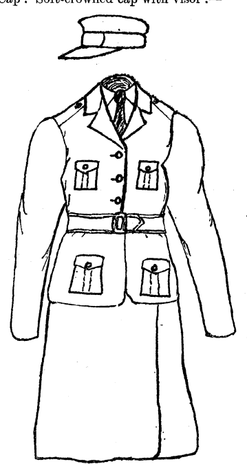
Uniform for other Members.

Khaki cotton drill costume uniform with four military pockets in coat; self-coloured belt; uniform to be worn with khaki shirt and tie; skirt pleated side back and side front; the uniform being indicated in the diagram below. Cap: Soft-crowned cap with visor:—