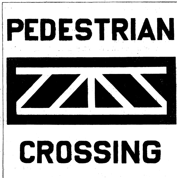
DIAGRAM NO 1